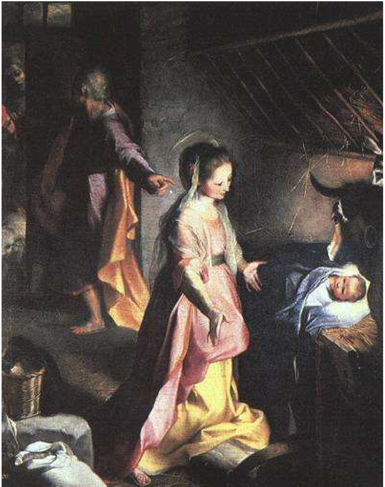
Barocci, Federico ~ The Nativity, 1597, oil on canvas, Museo del Prado, Madrid