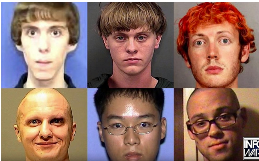
Six of the Most Recent Mass Shooters in the USA

However, there is another argument that deserves addressing: Milo Yiannopoulos persuasively argues that it is one of the side effects of toxic feminism . Women are over represented in the modern educational establishment. Most of these women are left-wing and the majority are signed-up feminists spouting all the usual feminist drivel with which we are all now so painfully familiar. - Ed]